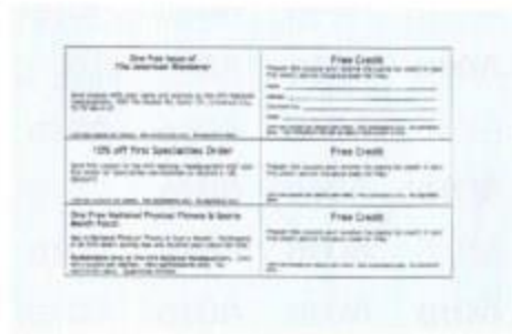
2 - New walker coupons